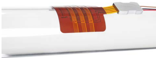
Figure 4 FHF01 fits flat and curved surfaces