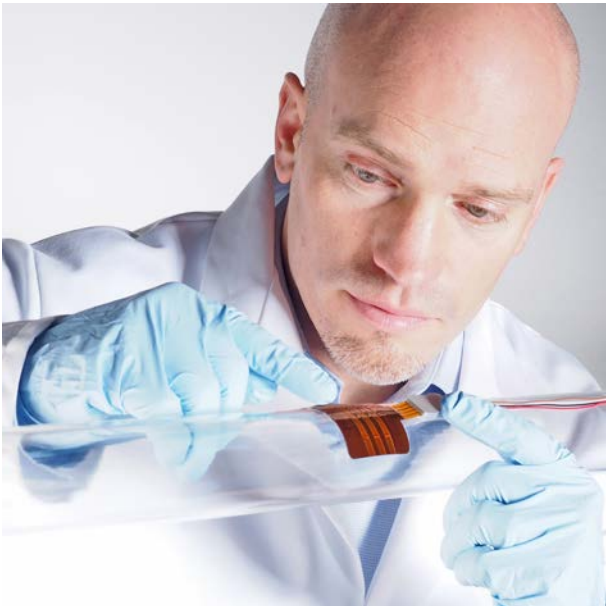
Figure 2 FHF01 being installed on a tube